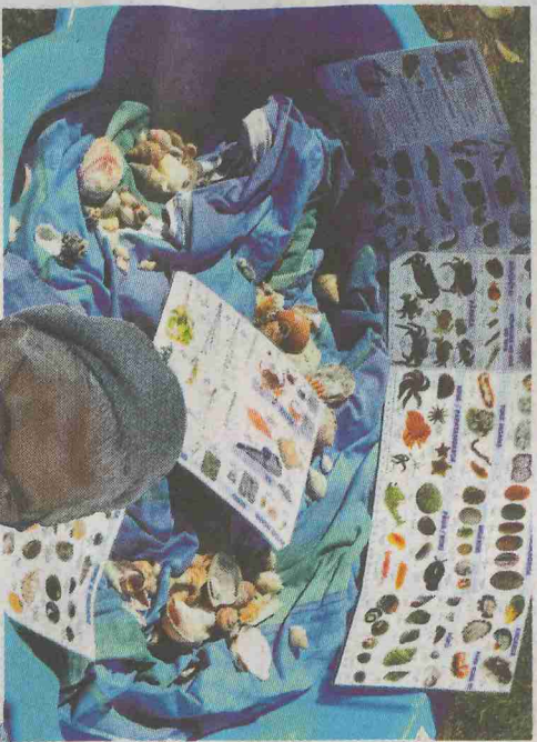
> BOTH dry and wet displays help the attendees learn more about the water environment. OS0012-08