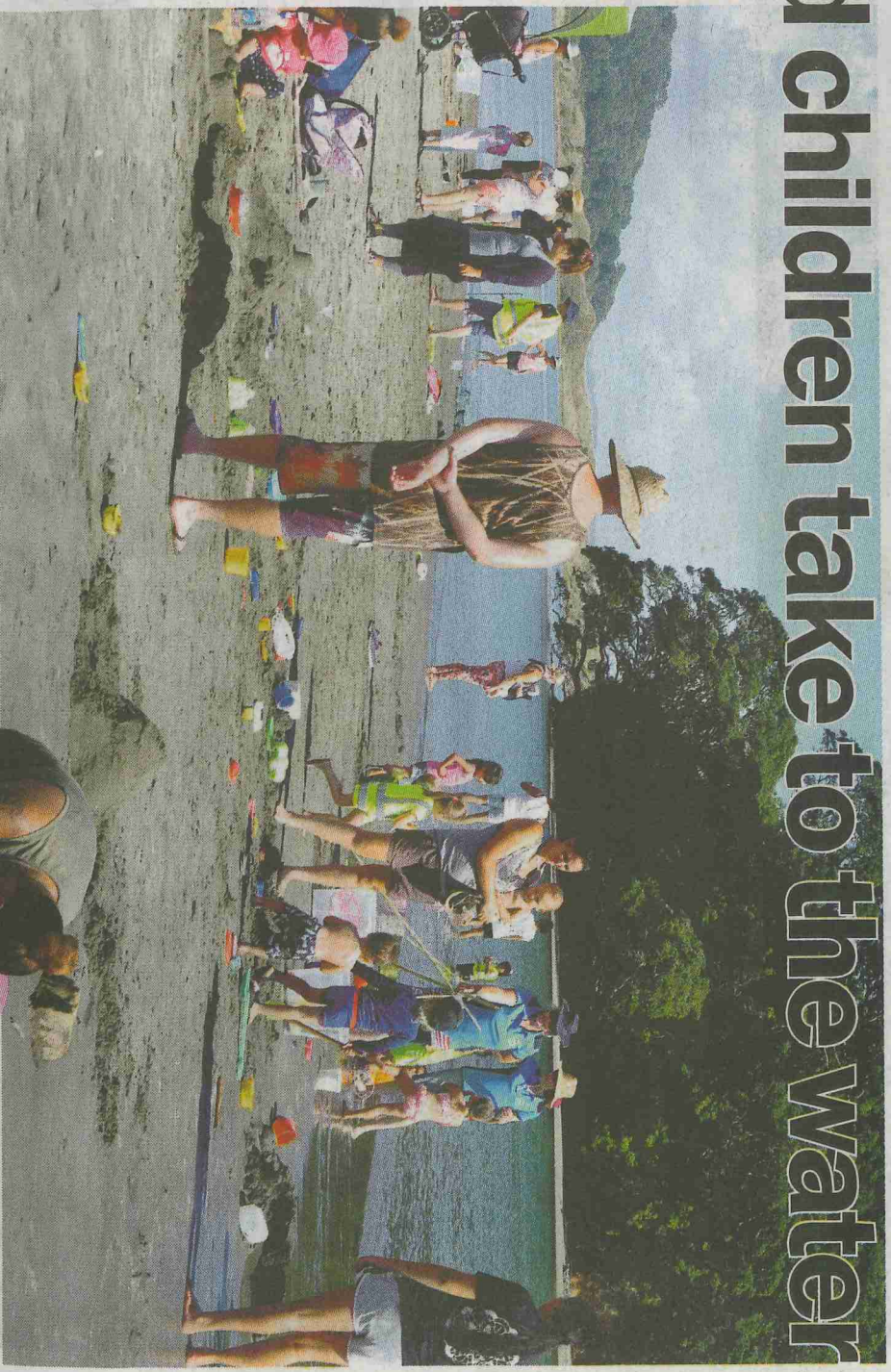
> CHILDREN and adults mingle at the water’s edge.

The Tikiina o Taroio Moana – Care for our seas – event ran from 10am to 12.30pm.