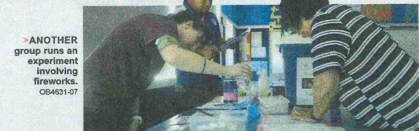
>ANOTHER group runs an experiment involving fireworks. OB4631-07