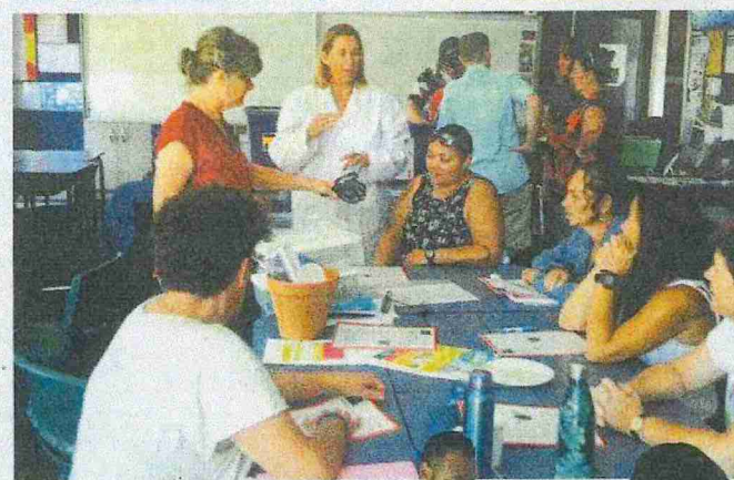
>ORGANISED into groups, staff members act as students and teachers with the kits. OB4631-04